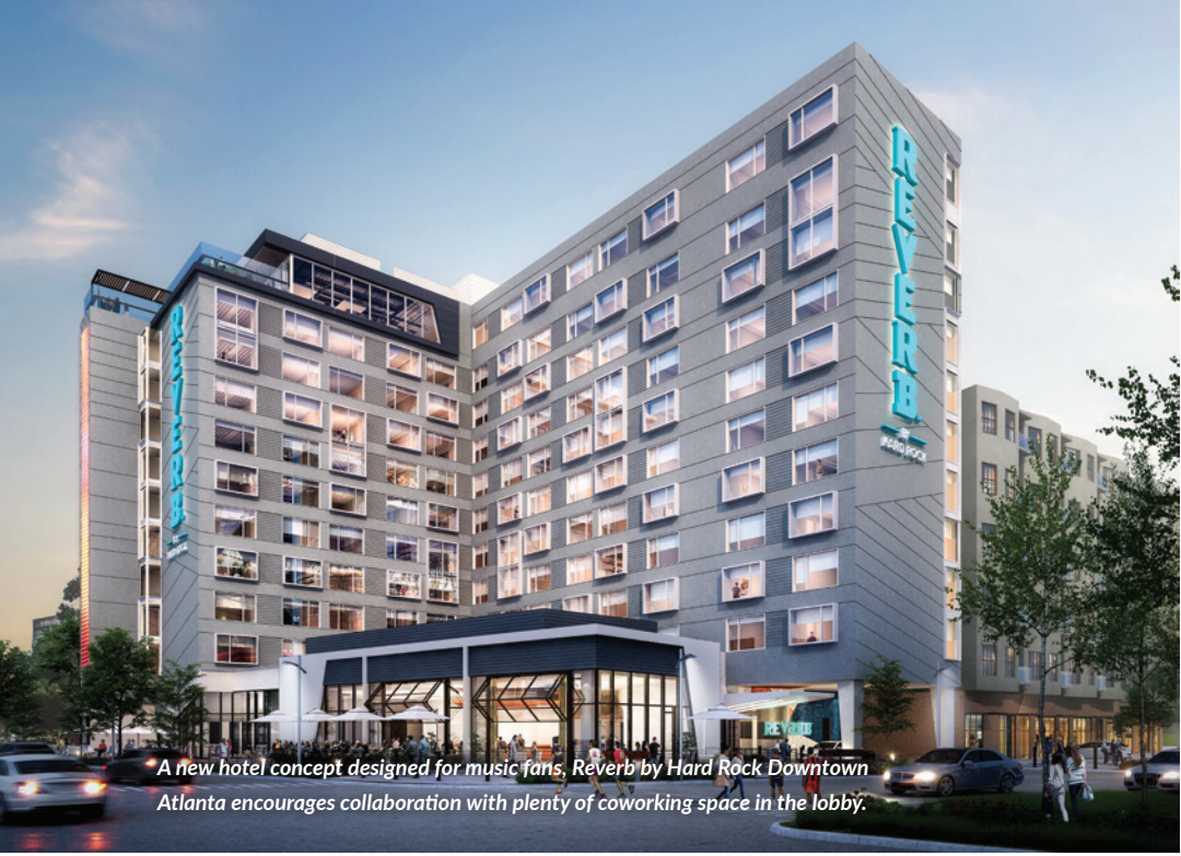
A new hotel concept designed for music fans, Reverb by Hard Rock Downtown Atlanta encourages collaboration with plenty of coworking space in the lobby.