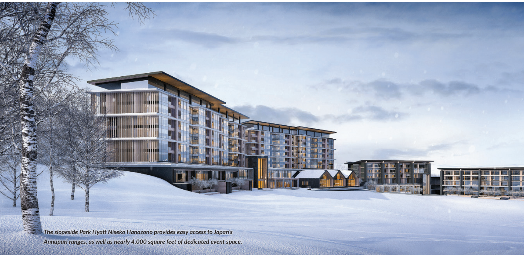
The slopeside Park Hyatt Niseko Hanazono provides easy access to Japan's Annupuri ranges, as well as nearly 4,000 square feet of dedicated event space.