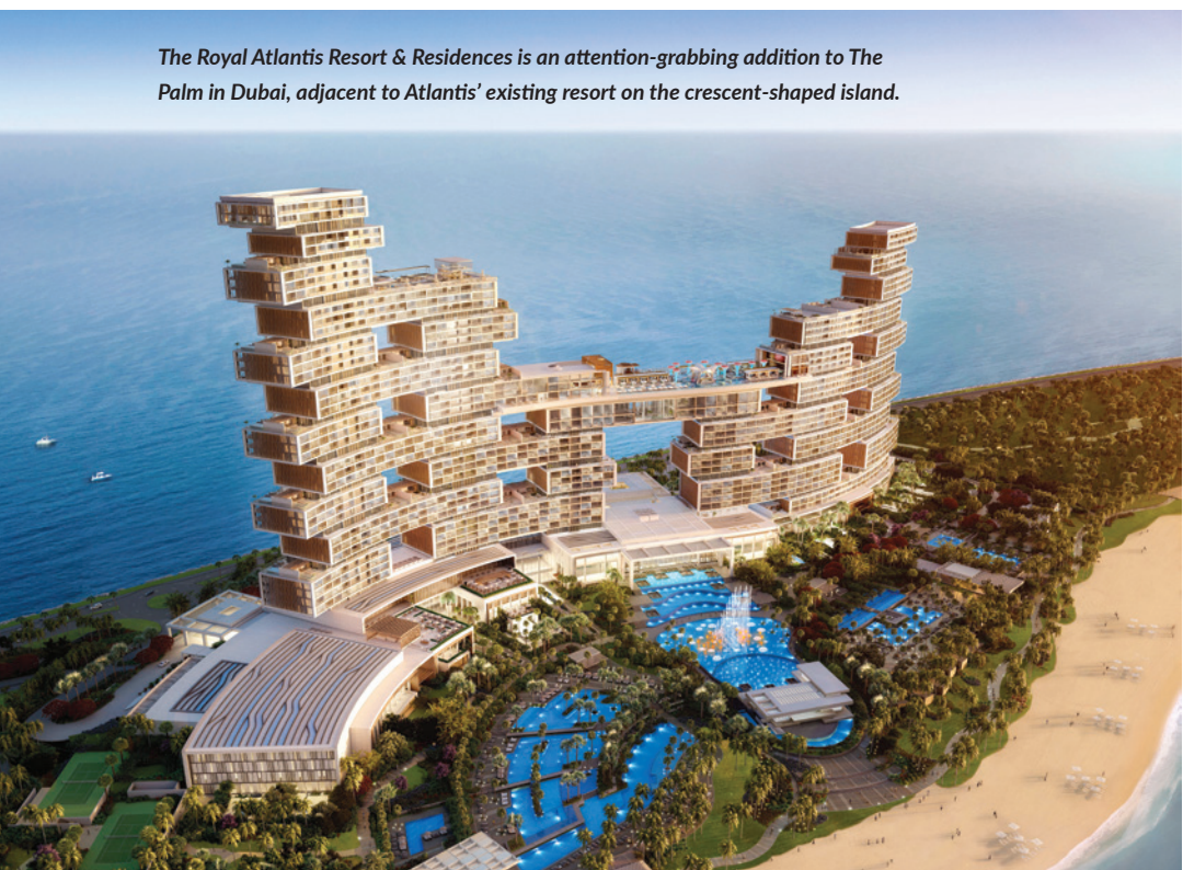
The Royal Atlantis Resort & Residences is an attention-grabbing addition to The Palm in Dubai, adjacent to Atlantis' existing resort on the crescent-shaped island.

OPENING March ROOMS 366 MEETING SPACE 17,254 square feet THE BUZZ Surrounded by unprecedented views of the Nile and Old Cairo, architect Michael Graves' seven-story podium and two towers stand front and center on Cairo's Corniche. THE PERKS Indoor and outdoor pools, spa, and six bars and eateries, with everything from Sicilian-Arabian delicacies to Singaporean cuisine. 800.542.8680; stregis.com