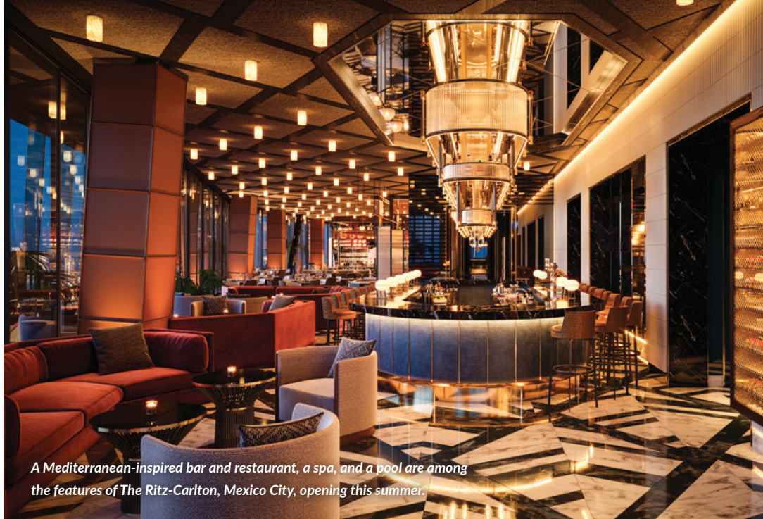
A Mediterranean-inspired bar and restaurant, a spa, and a pool are among the features of The Ritz-Carlton, Mexico City, opening this summer.

OPENING May 5 ROOMS 324 MEETING SPACE More than 13,000 square feet THE BUZZ A multimillion-dollar transformation turns La Tranquila Resort into a Conrad and expands Hilton's presence on the Pacific coast of Mexico. THE PERKS Two-mile beach,