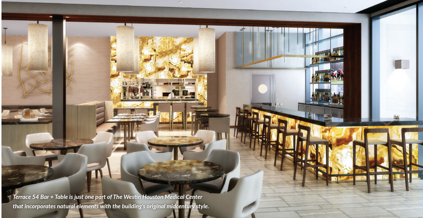
Terrace 54 Bar + Table is just one part of The Westin Houston Medical Center that incorporates natural elements with the building's original midcentury style.

smart technology, and direct access to sports and concerts at Mercedes-Benz Stadium. 888.519.6683; reverbhotels.com