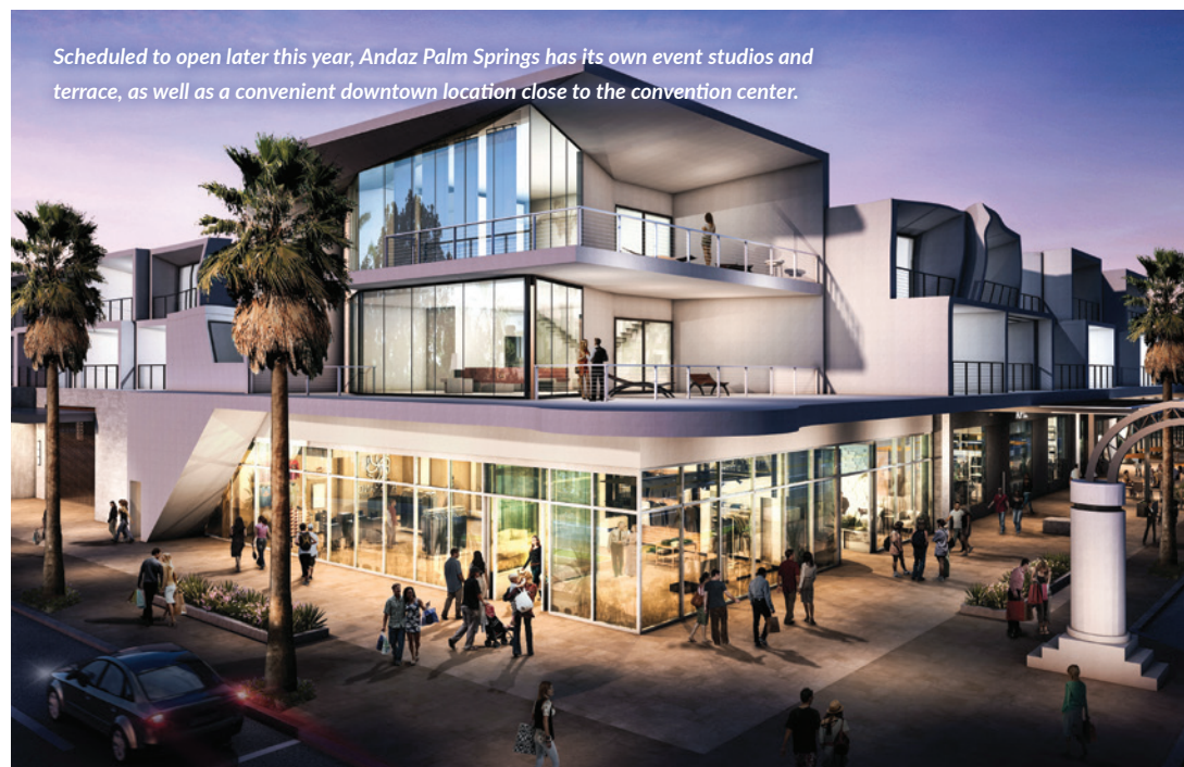
Scheduled to open later this year, Andaz Palm Springs has its own event studios and terrace, as well as a convenient downtown location close to the convention center.

quick mile and a half — or two Metro stops — from the U.S. Capitol, the Thompson mirrors its newly trendy neighborhood with industrial Navy Yard patterns and textures. THE PERKS Views of the Nationals Park stadium or Anacostia River, fitness center, rooftop and lobby bars, and Maialino Mare restaurant, scion of the celebrated Maialino in New York City. 800.233.1234; thompsonwashingtondc.com