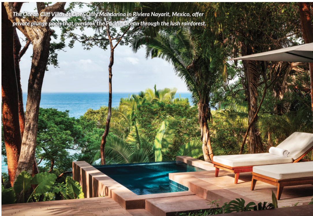
The Ocean Cliff Villas at One&Only Mandarin in Riviera Nayarit, Mexico, offer private plunge pools that overlook the Pacific Ocean through the lush rainforest.

OPENING June 1 ROOMS 104 MEETING SPACE * THE BUZZ Set on a beachfront cliff, a new One&Only resort launches Mandarin, a billion-dollar lifestyle community near Punta Mita. THE PERKS Treehouse and villa accommodations, private pools and butlers, casual and fine-dining restaurants, spa, beach club, infinity and kid-friendly pools, ocean sports, Adventure Playground with climbing and zip lines, polo and equestrian club, and an extensive trail system for walking, cycling, and horseback riding. 866.552.0001; oneandonlyresorts.com/mandarina