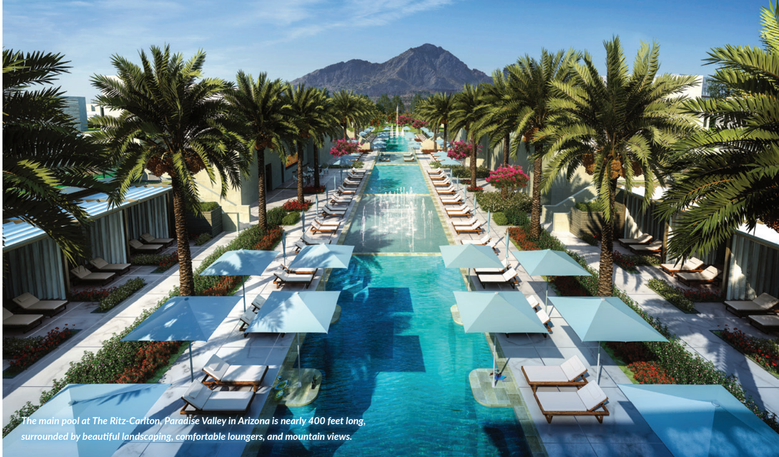
The main pool at The Ritz-Carlton, Paradise Valley in Arizona is nearly 400 feet long, surrounded by beautiful landscaping, comfortable loungers, and mountain views.

retreat, children's program, signature restaurant, and the area's highest rooftop lounge, with spectacular views of Disney fireworks. 800.831.4004; jwmarriottanaheimresort.com