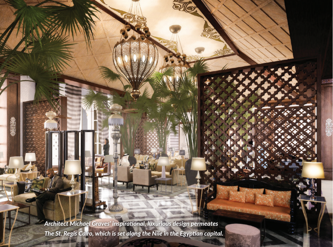
Architect Michael Graves' inspirational, luxurious design permeates The St. Regis Cairo, which is set along the Nile in the Egyptian capital.