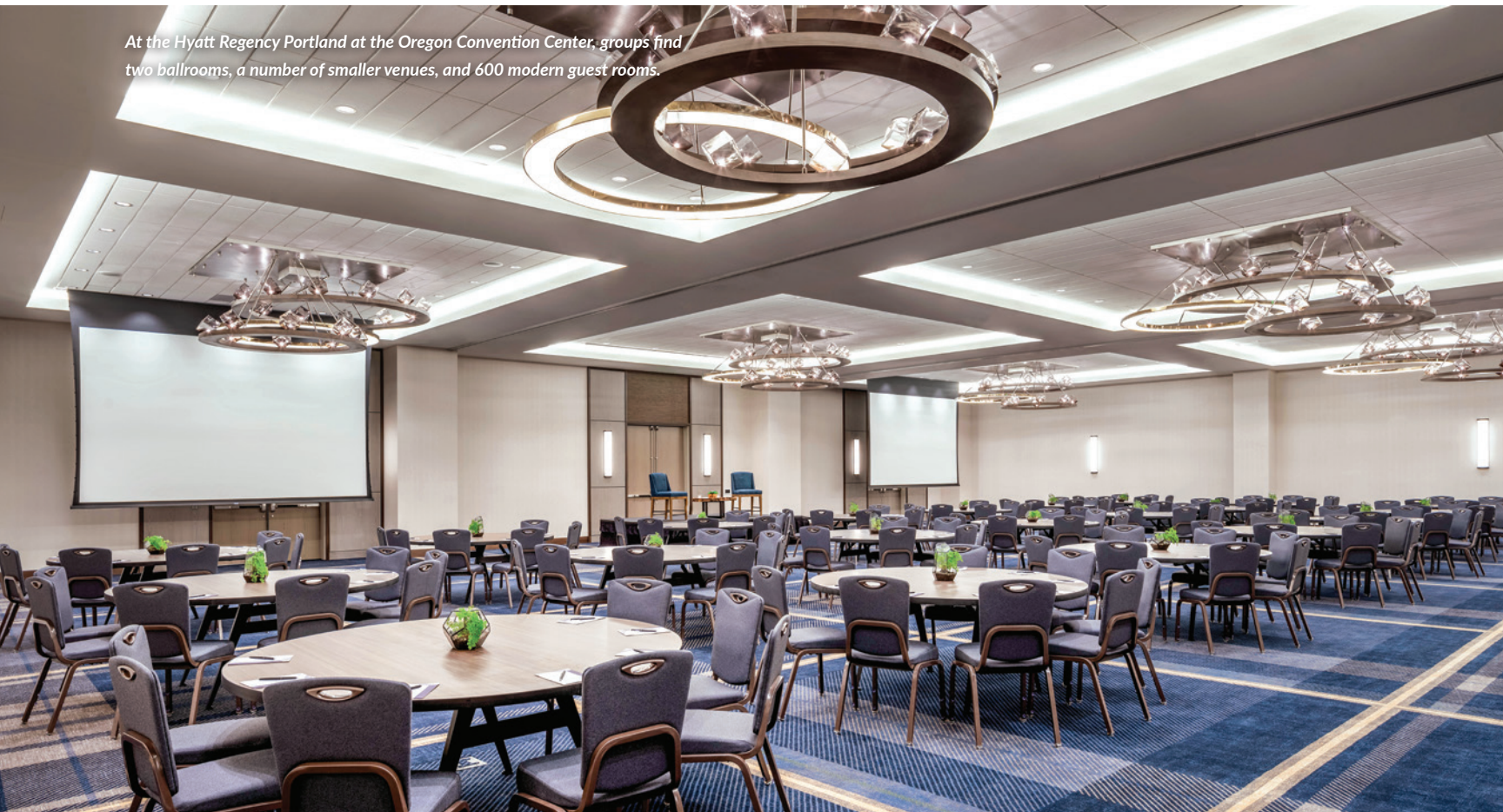
At the Hyatt Regency Portland at the Oregon Convention Center, groups find two ballrooms, a number of smaller venues, and 600 modern guest rooms.

OPENING Fourth quarter ROOMS 175 MEETING SPACE More than 5,000 square feet THE BUZZ Los Angeles-based sbe brings its ultra-luxury touch to a sparkling new 12-story building in Mount Vernon Triangle, a vibrant neighborhood in Washington's northwest quadrant. THE PERKS Gym, spa, rooftop pool and terrace, and restaurant by the great visionary chef and restaurateur José Andrés. 844.382.2267; slshotels.com