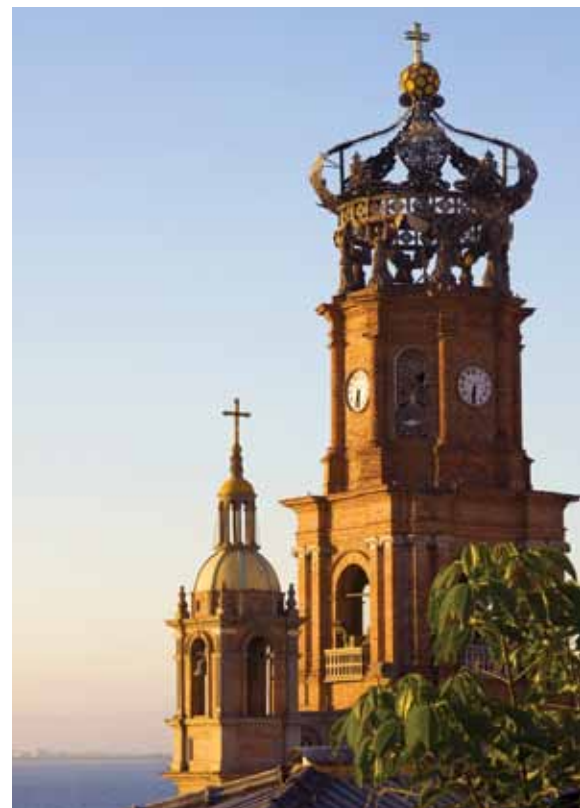
Puerto Vallarta's iconic Los Arcos Amphitheater (opposite) provides a scenic frame for the area's natural beauty. Other attractions (from above left) range from shopping to culinary feasts to historic landmarks, like the magnificent Church of Our Lady of Guadalupe.